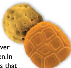
Microscopic View of Actual Pollen Grains

Pollen Burst™ is packed with solid nutrition. Flower pollen is one of the most complex structures of life on this planet. Beneath the outer husk of a pollen grain (which happens to be the only allergic portion of pollen) is a hypoallergenic, unadulterated nutrient core. This inner core is nature's perfect whole-food source, containing the building blocks of plant life. Extensive scientific research has identified over 3,000 different life-enhancing substances in pollen. In fact, each grain of Pollen contains micronutrients that support optimal health, longevity, and sustained energy.